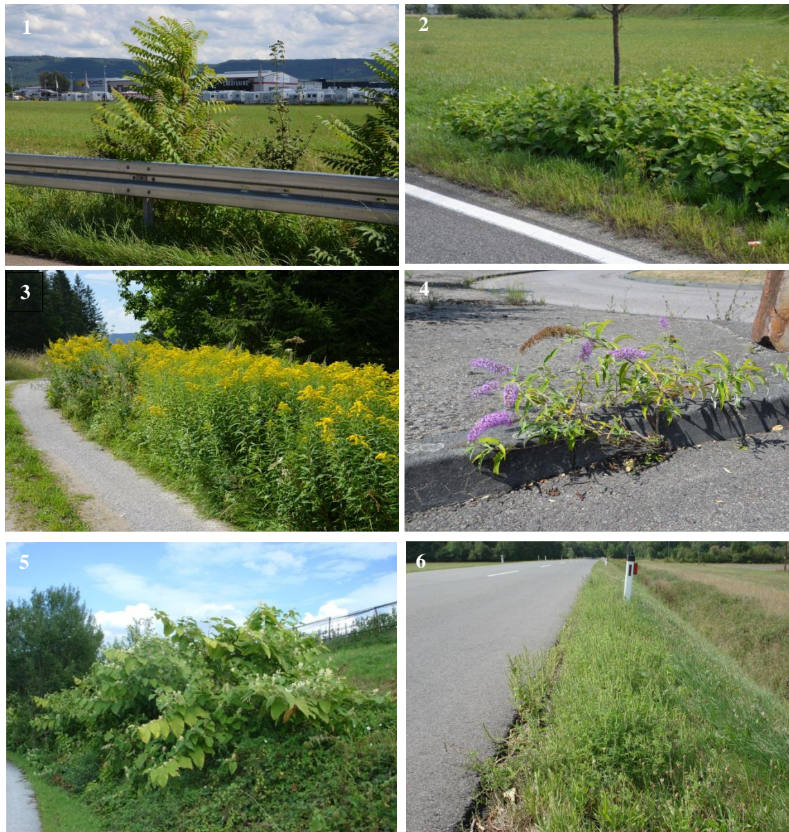
(1) Ailanthus altissima (2) Fallopia japonica , (3) Solidago spp., (4) Buddleja davidii , (5) Fallopia sachalinensis , and (6) Ambrosia artemisiifolia (Photos: S. Follak).